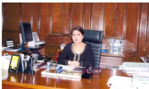
Dr. Shamshad Akhtar, Governor