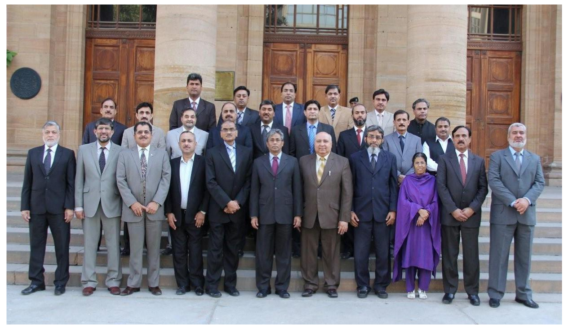
Management of SBP Banking Services Corporation

The CMs' Forum consists of Chief Managers of SBP-BSC field offices situated in 15 major cities of Pakistan. It is a consultative and coordination body which assures smooth implementation of various policies; discusses and improves the operations of the Bank with addressing the issues/ challenges faced and facilitate the HOD Forum/ top management in decision making.